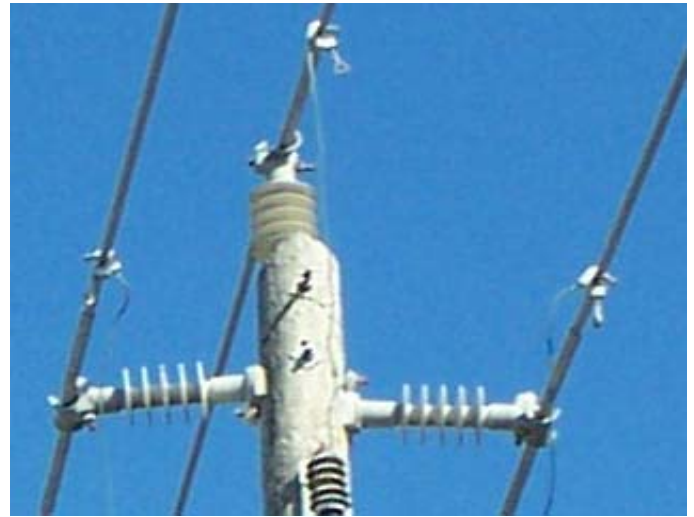
The 23 kV line along St. Augustine Beach had very poor performance before the porcelain line posts were replaced with K-Line's Silicone Rubber Universal Line Posts (K-Clamps)

Overhead lines along the eastern Florida seacoast are regularly coated with a salt-laden rain driven by high on-shore winds. Experience with porcelain insulators was that sometimes even with a continuous line washing program insulator flashovers and line outages occurred. This happened even though very high leakage distance porcelain insulators, some with purported “protected leakage”, were used.